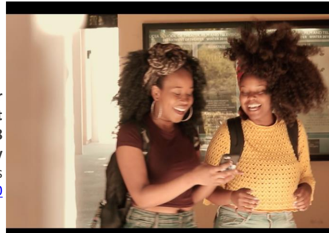
Stronger Together 2 nd Place, Youth & Young Adult 2018 Los Angeles County Mental Health Matters https://vimeo.com/258020590