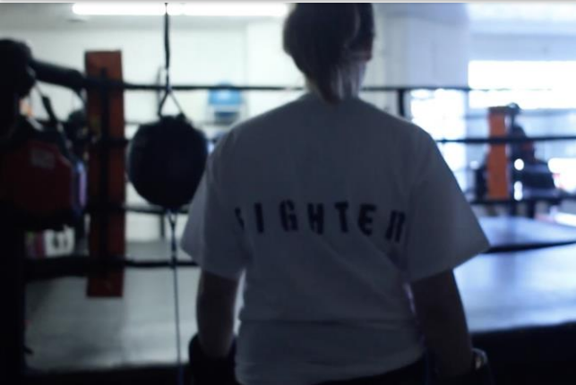
A Fighting Chance 2 nd Place Regional 2018 Los Angeles County Mental Health Matters https://vimeo.com/259420976