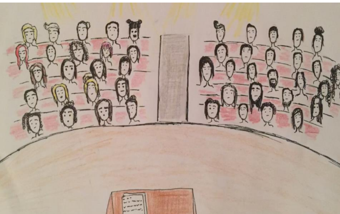
Fear 2016 Monterey County Mental Health Matters https://vimeo.com/165505059