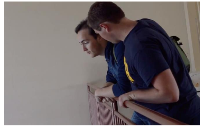
Talk About It 2016 Monterey County Suicide Prevention https://vimeo.com/165504792